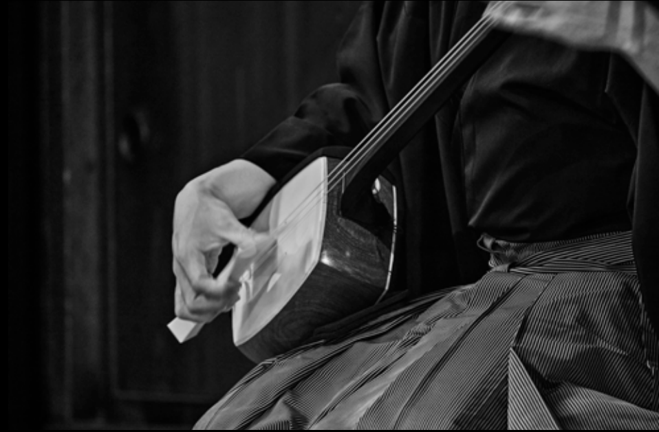
These children practice with the professional and are inspired by the technique. It is a special time that bonds the feelings of all for the festival music.