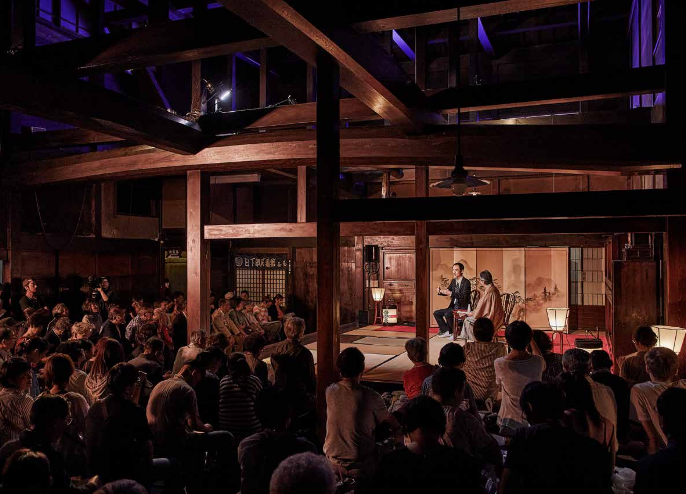
The beams of the Kusakabe home are amazing! Tonight, there is a lecture performance explaining traditional entertainment and techniques. Takayama “ danna ” (heads of households) are famous for generously supporting the architecture, the wood crafts and festivals here. Which is why these craftsmanship skills continue to survive.